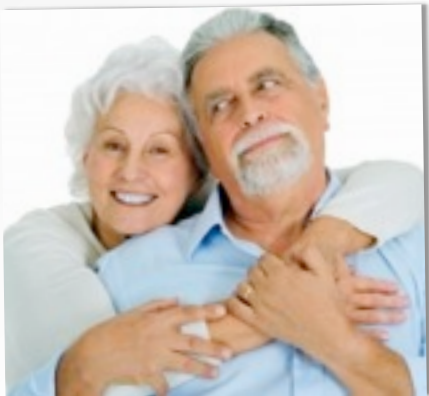
Seniors' Resource Directory Group