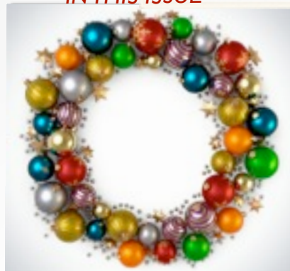
Holiday Office Hours