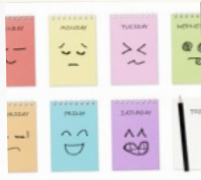
Save the Date!